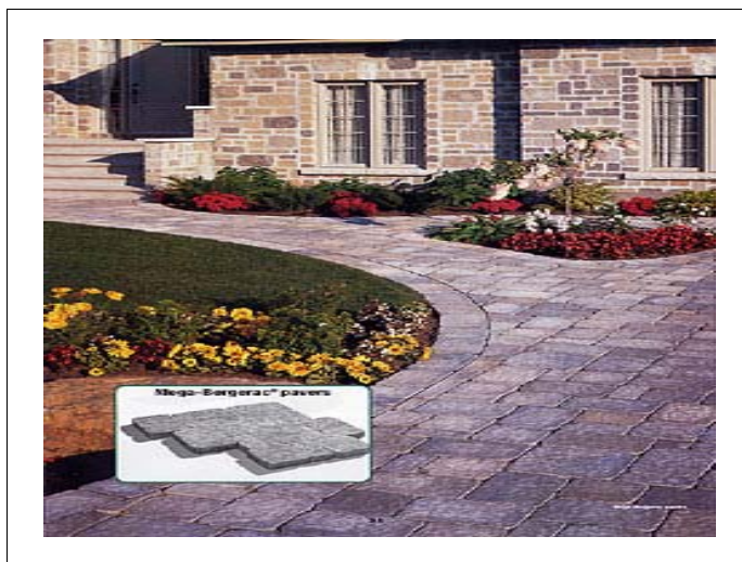
Mega-Bergerac Pavers – Gray

Many properties around Tulsa have Rail Road Tie walls that are deteriorating and coming to